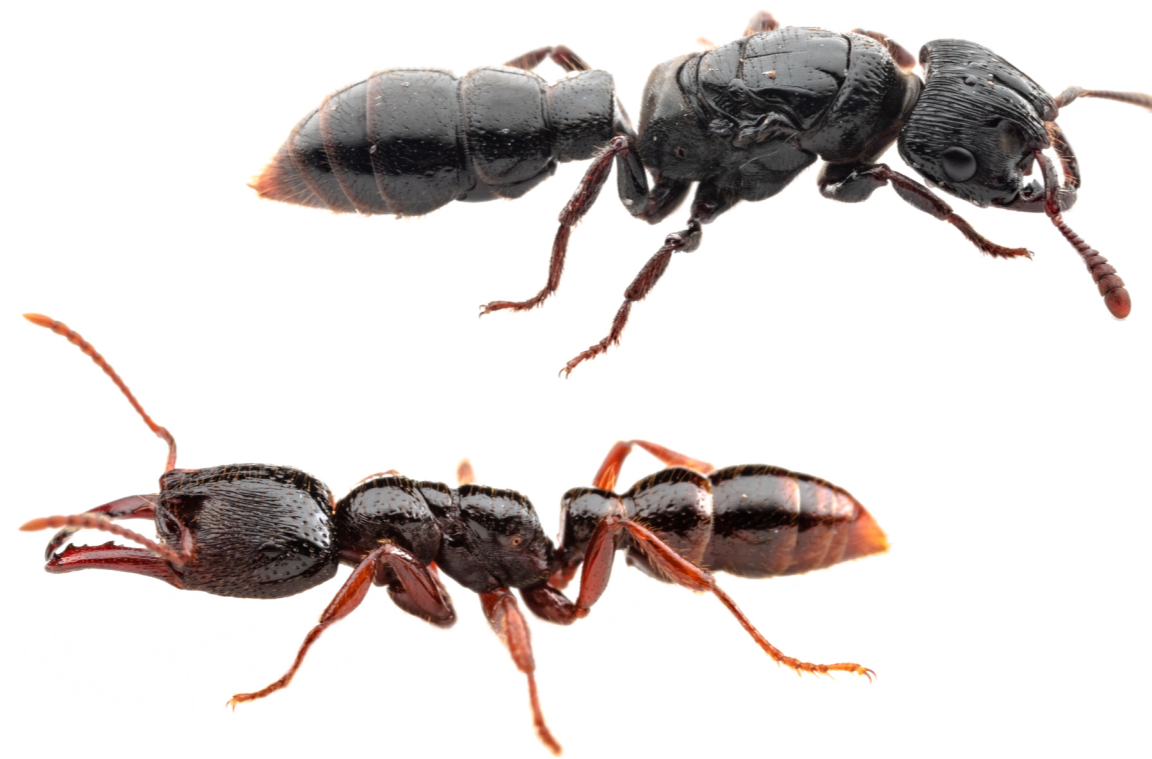
Amblyopone australis Erichson, 1842