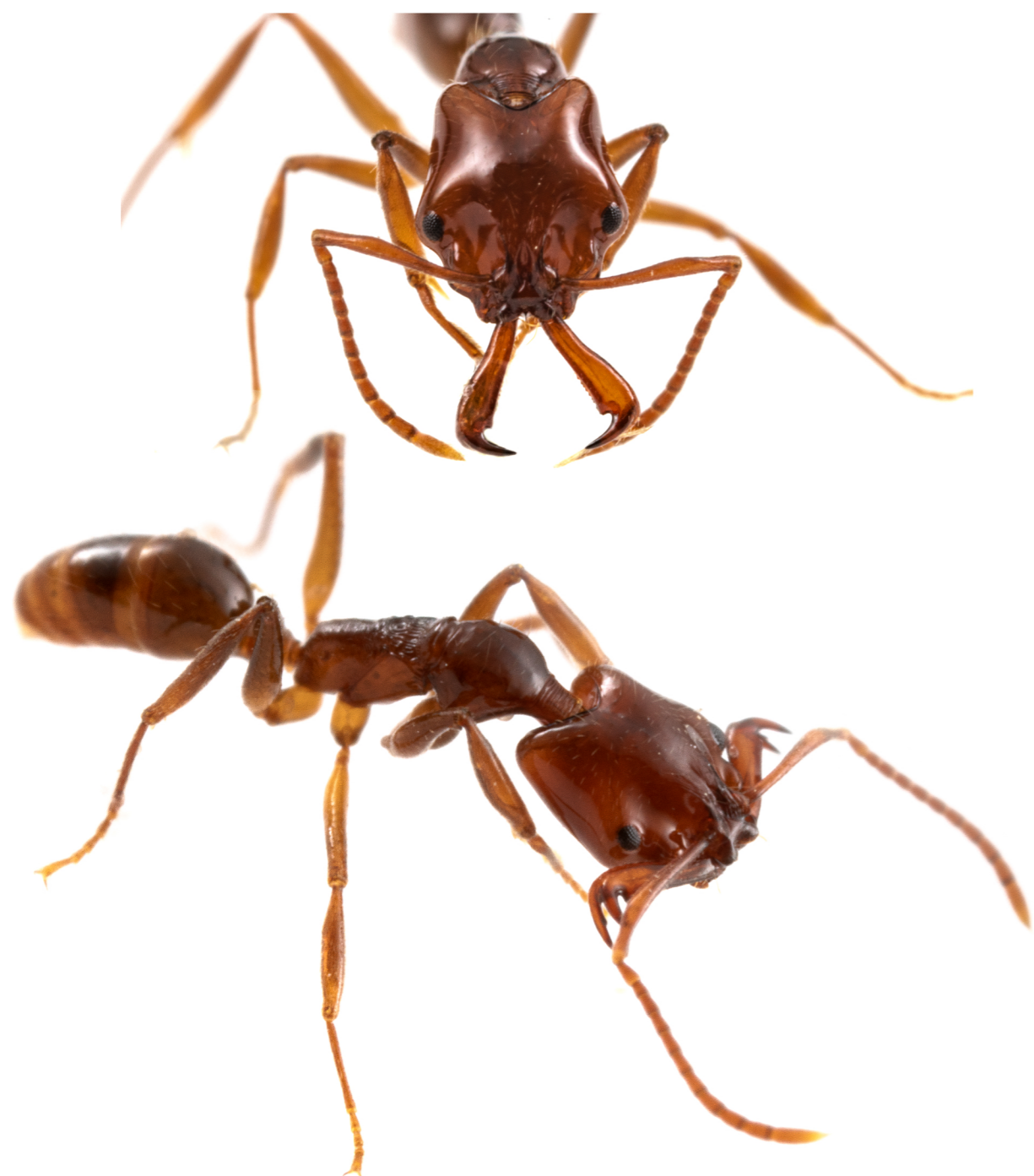
Anochetus isolatus Mann, 1919