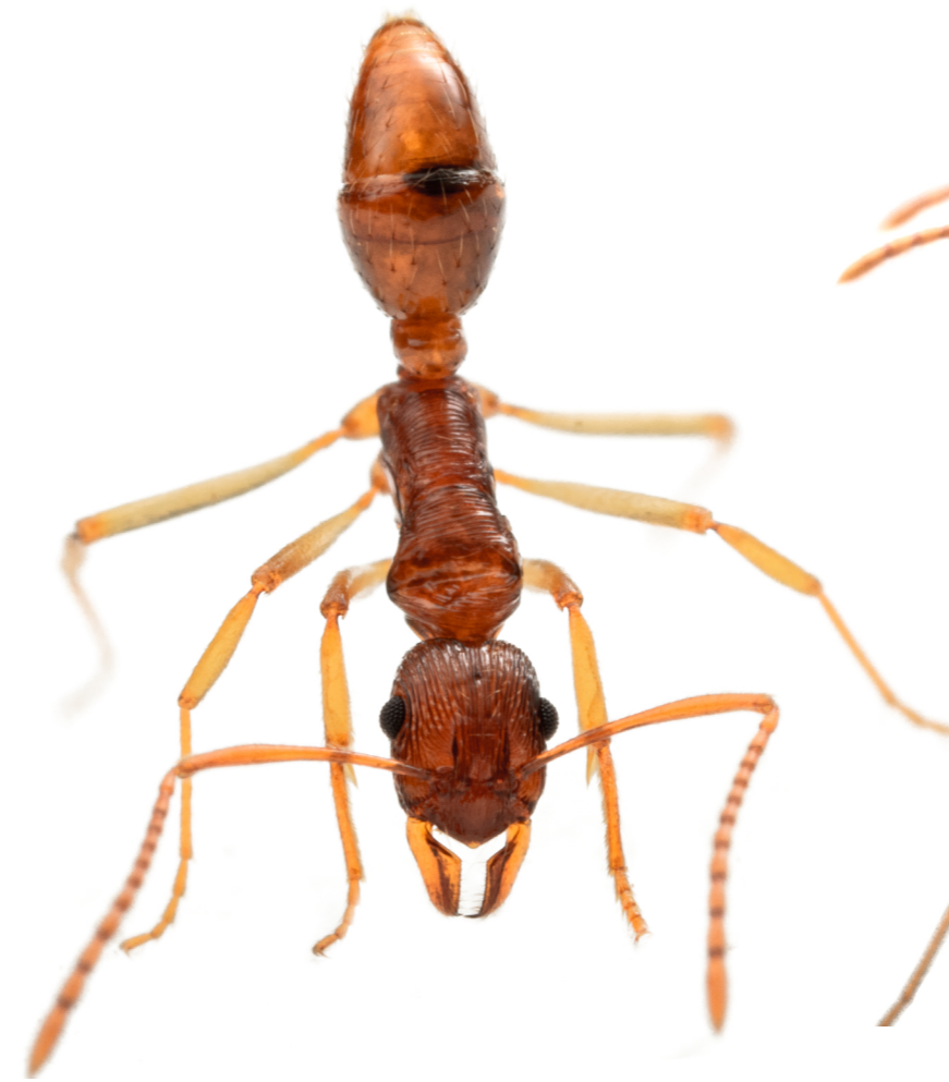
Gnamptogenys solomonensis Latke, 2004