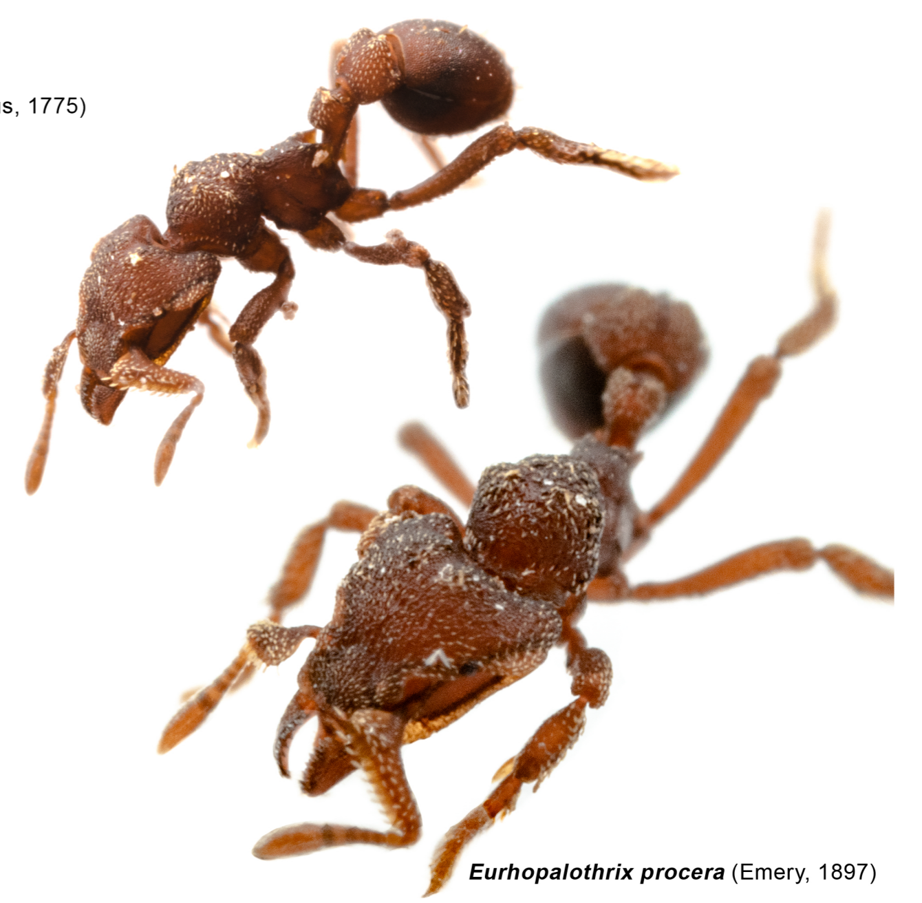
Eurhopalothrix procera (Emery, 1897)

This poster is based on a research collaboration with the communities and landowners in Kainake region. For more information, visit Kainake Project ( www.kainakeproject.org), Ants of New Guinea ( www.newguineants.org) and New Guinea Binatang Research Centre ( www.ngbinatang.com) Produced by: New Guinea Binatang Research Centre, Madang, PNG; National Laboratory of Ecological Analysis and Synthesis, UNAM, Mexico; and Biology Center, Czech Academy of Sciences Support: The National Geographic Society