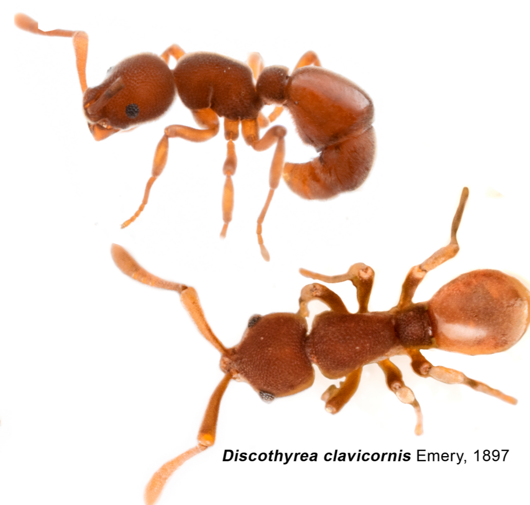
Discothyrea clavicornis Emery, 1897