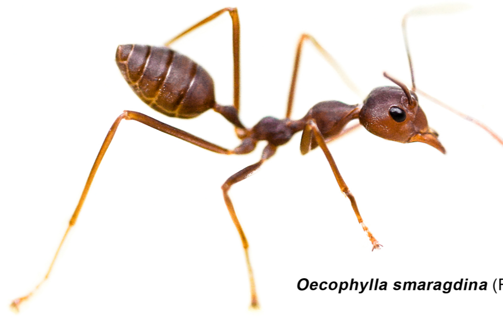
Oecophylla smaragdina (Fabricius, 1775)