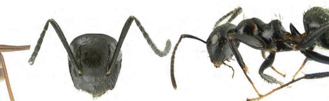
Colobopsis vitrea (Smith, 1860)