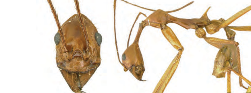
Aphaenogaster dromedaria Emery, 1900