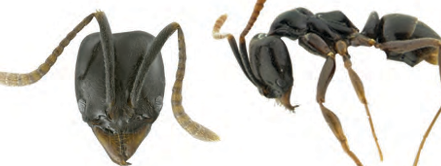
Brachyponera croceicornis (Emery, 1900)