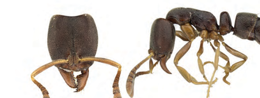
Hyponopone biroi (Emery, 1900)