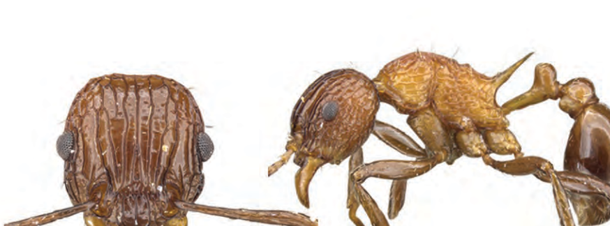
Tetramorium carinatum (Smith, 1859)