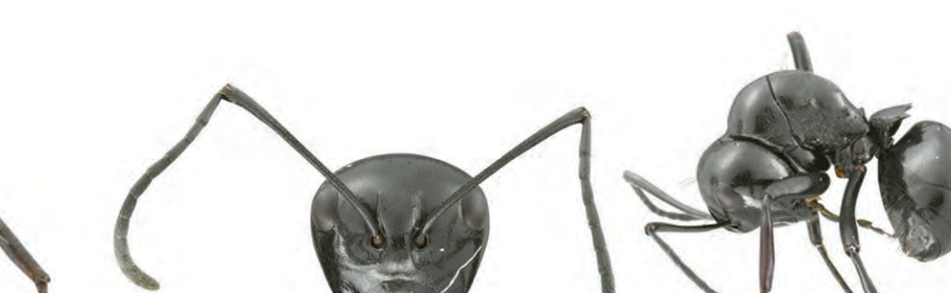
Polyrhachis debilis Emery, 1887