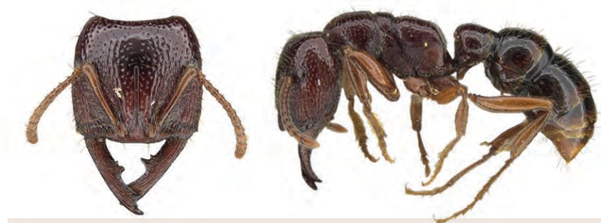
Amblyopone australis Erichson, 1842