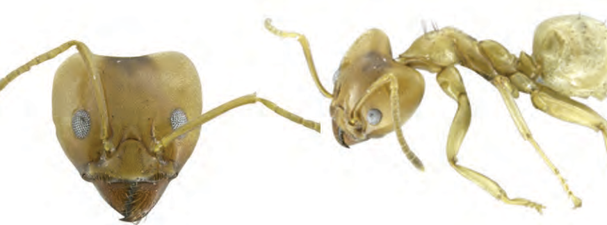
Philidris myrmecodiae (Emery, 1887)