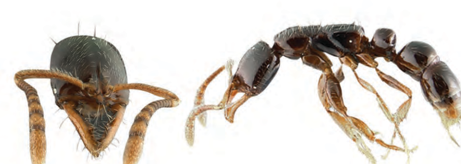
Myopias tenuis (Emery, 1900)