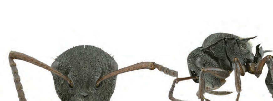
Polyrhachis argenteosignata Emery, 1900