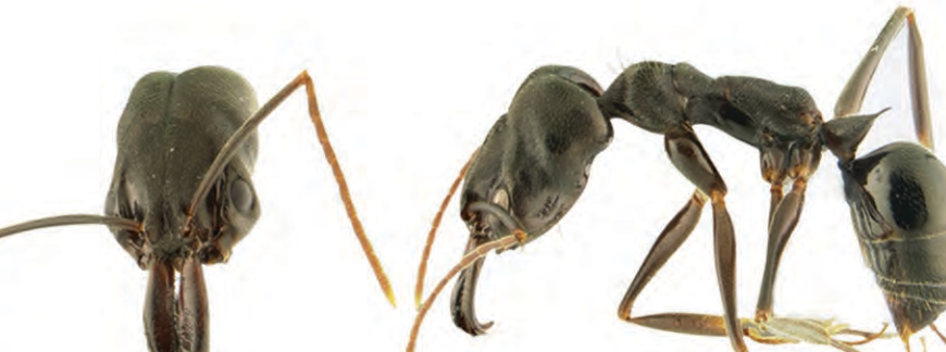
Odontomachus simillimus Smith, 1858