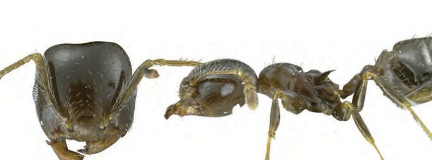
Crematogaster polita Smith, 1865