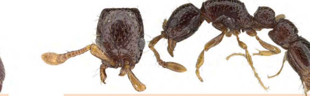
Parasyscia inconspicua (Emery, 1901)