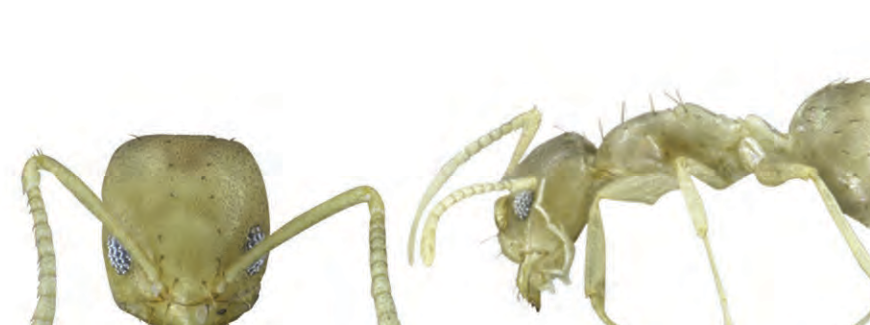
Paraparatrechina minutula (Forel, 1901)