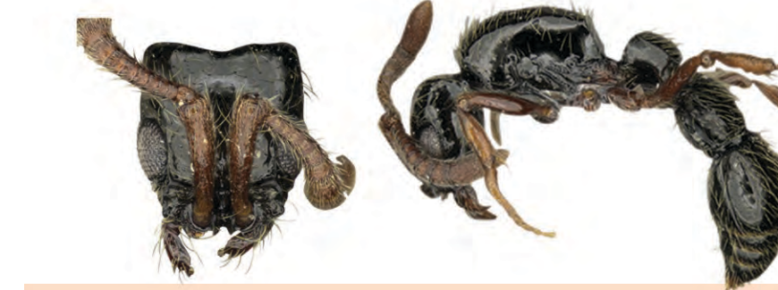
Lioponera marginata (Emery, 1897)