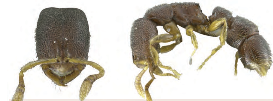
Prionopelta opaca Emery, 1897