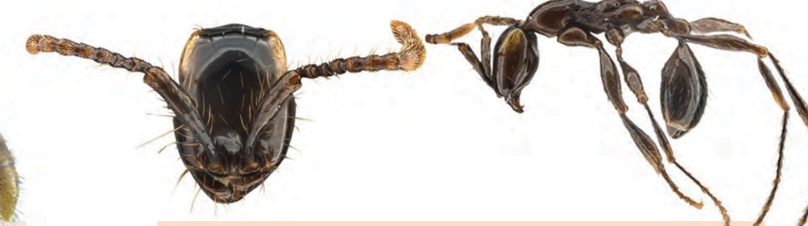
Aenictus huonicus Wilson 1964