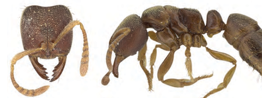
Cryptopone motschulskyi Donisthorpe, 1943