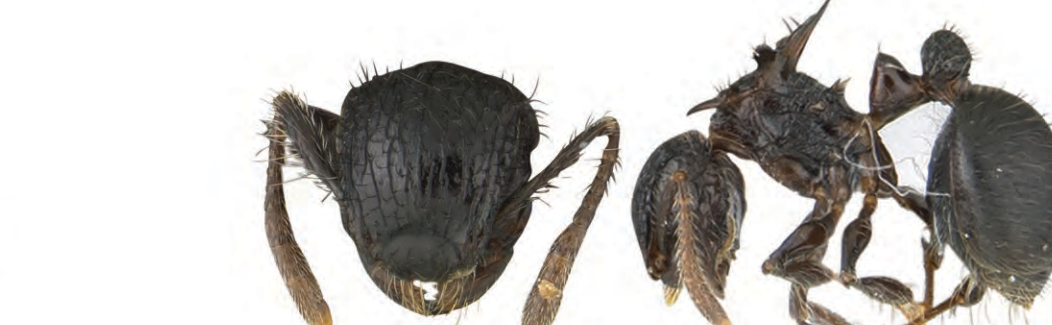
Meranoplus armatus Smith, 1862