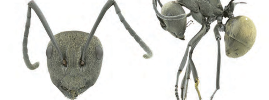
Polyrhachis dives Smith, 1857