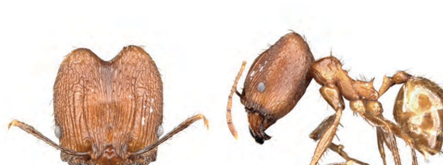
Pheidole hospes Smith, 1865