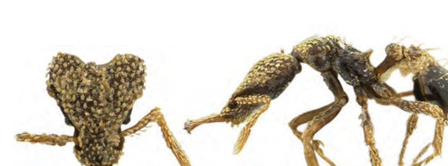
Strumigenys horvathi Emery, 1897