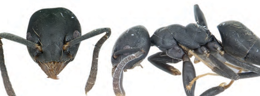
Technomyrmex albipes (Smith, 1861)