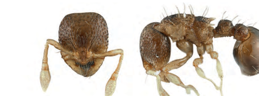
Adelomyrmex biroi Emery, 1897