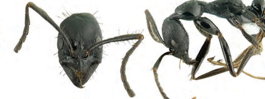
Leptogenys diminuta (Smith, 1857)