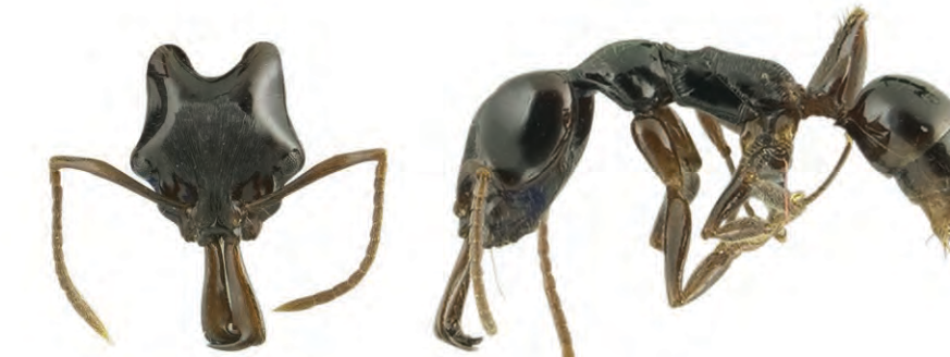
Anochetus cato Forel, 1901