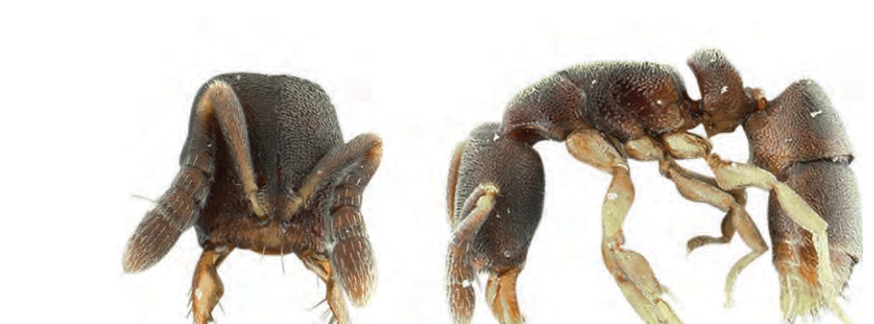
Poner a sp.3 MAD