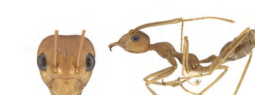
Oecophylla smaragdina (Fabricius, 1775)