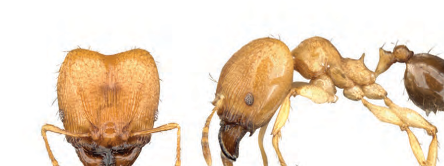
Pheidole sericella Viehmeyer, 1914