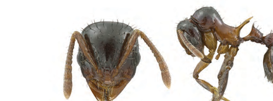
Lordomyrma furcifera Emery, 1897