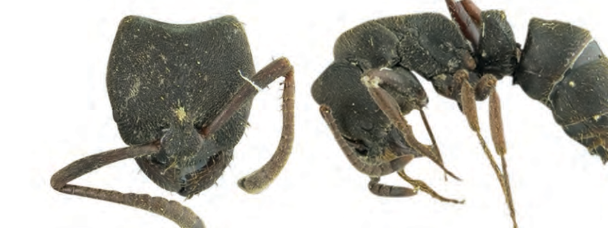
Ectomyrmex aciculatus (Emery, 1901)