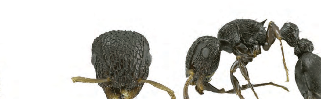
Romblonella scrobifera (Emery, 1897)