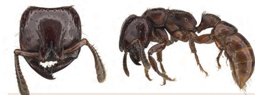
Myopopone castanea (Smith, 1860)