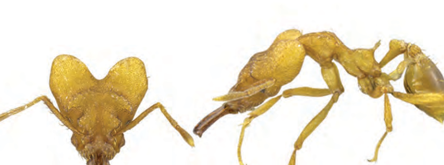
Strumigenys loriae Emery, 1897