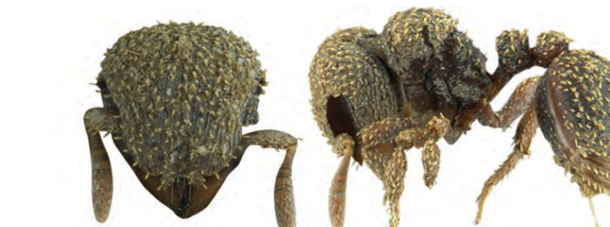
Calyptomyrmex beccarii Emery, 1887