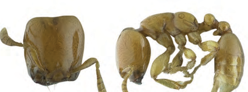
Liomyrmex gestroi (Emery, 1887)