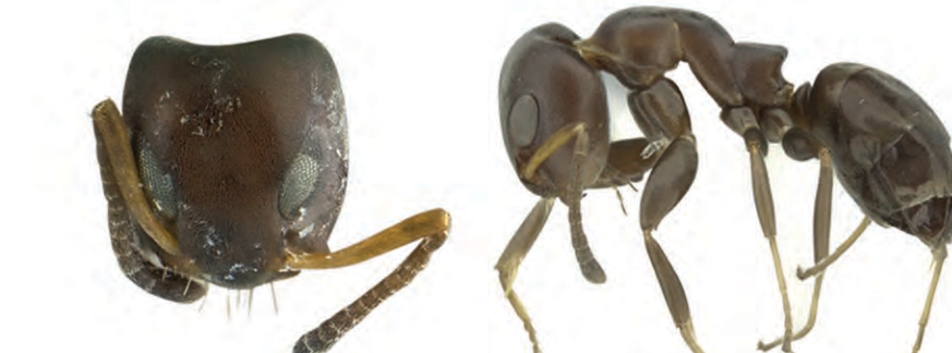
Turneria arbusta Shattuck 1990