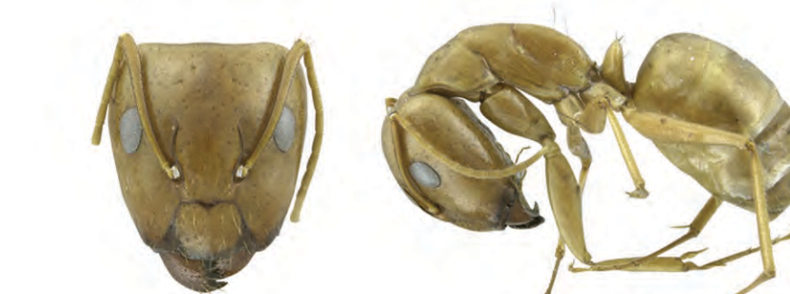
Camponotus chloroticus Emery, 1897