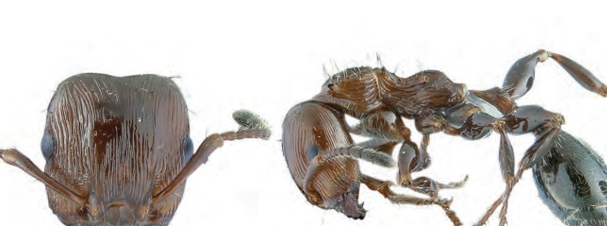
Podomyrma sp. MAD5