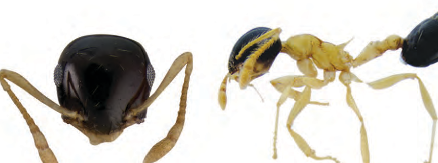
Crematogaster emeryi Forel, 1907