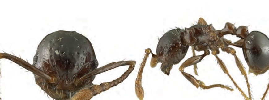
Pristomyrmex quadridens Emery, 1897