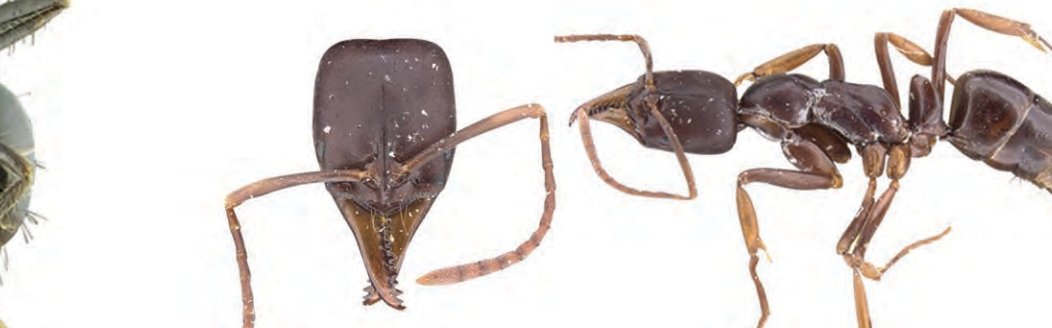
Mesoponera papuana (Viehmeyer, 1914)