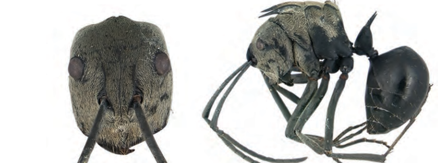
Polyrhachis sericata (Guérin-Méneville, 1831)