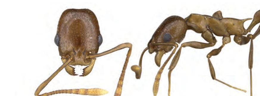
Cardiocondyla paradoxa Emery, 1897