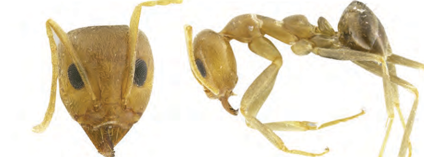
Iridomyrmex pallidus Forel, 1901