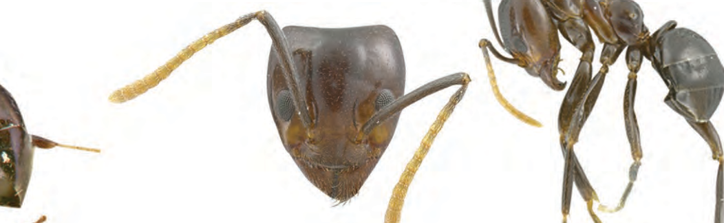
Papyrius nitidus (Mayr, 1862)