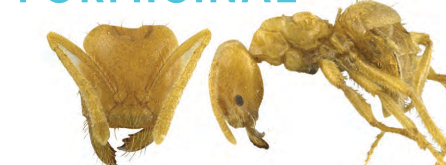
Acropyga acutiventris Roger, 1862