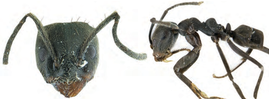
Anonychomyrma scrutator (Smith, 1859)