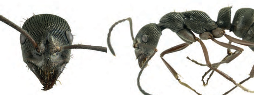
Diacamma rugosum (Le Guillou, 1842)