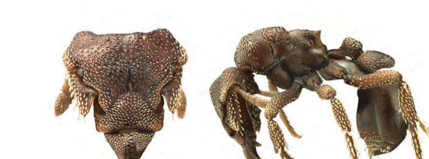
Eurhopalothrix procera (Emery, 1897)