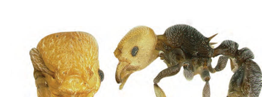
Tetramorium fulviceps (Emery, 1897)