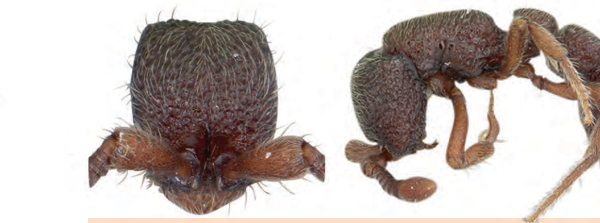
Ooceraea papuana Emery, 1897