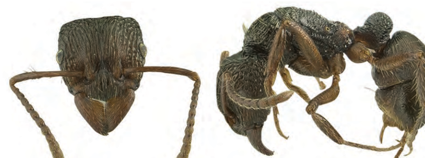
Rhytidoponera inops Emery, 1900