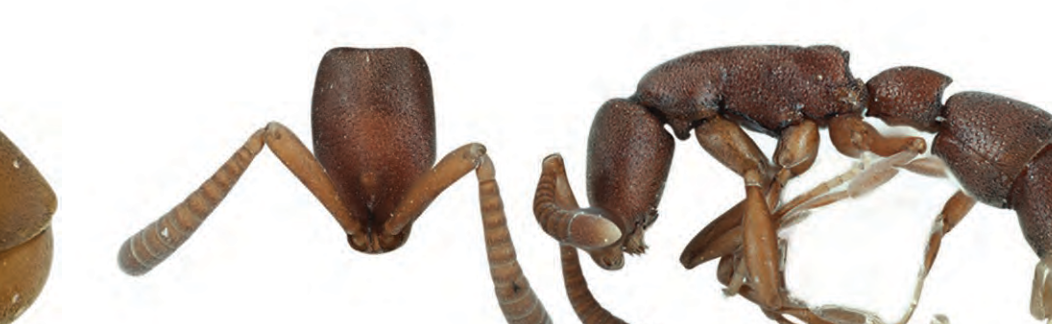
Probolomyrmex newguineensis Shattuck et al., 2012