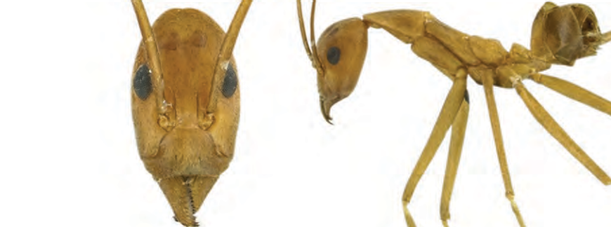
Leptomyrmex puberulus Wheeler, 1934