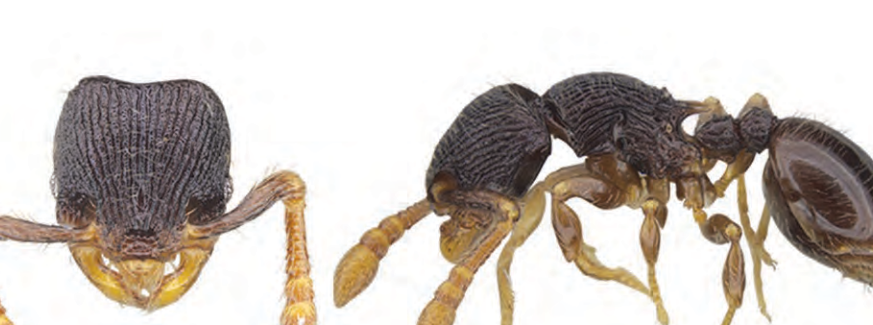
Myrmecina brevicornis Emery, 1897