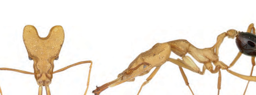
Strumigenys stemonyxis Brown, 1971