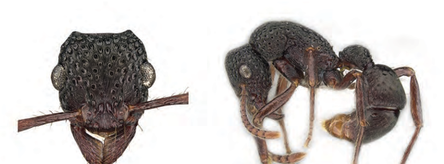
Gnamptogenys niuginensis Latkce, 2004