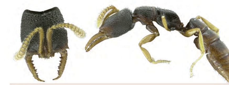
Fulakora sp.1 MAD