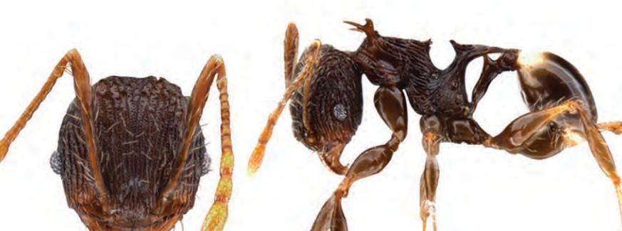
Pheidole cervicornis Emery, 1900