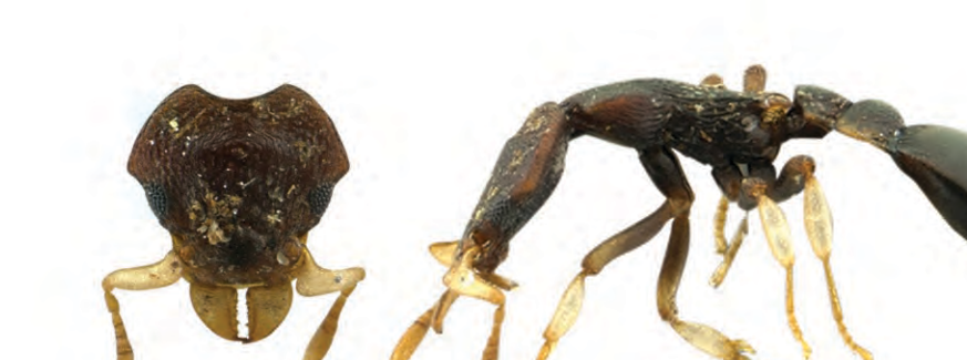
Colobostruma foliacea (Emery, 1897)