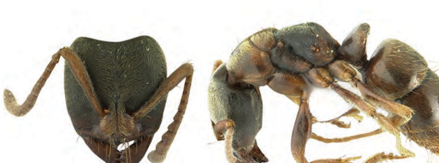
Pseudoponera stigma (Fabricius, 1804)