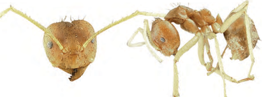
Pseudolasius australis Forel, 1915