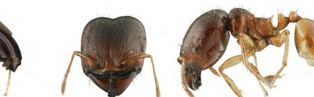
Carebara melanocephala (Donisthorpe, 1948)