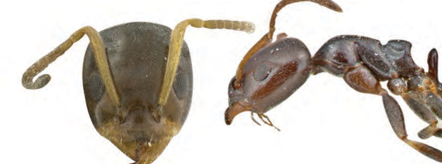
Ochetellus glaber Viehmeyer 1914