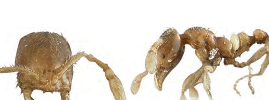
Solenopsis papuana Emery, 1900