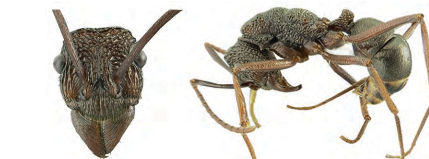
Rhytidoponera aenescens Emery, 1900