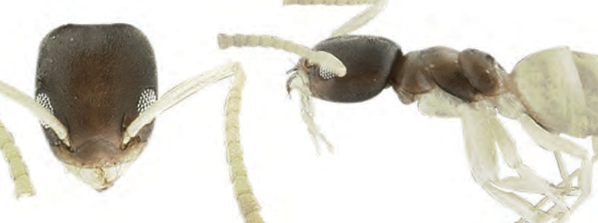
Tapinoma melanocephalum (Fabricius, 1793)