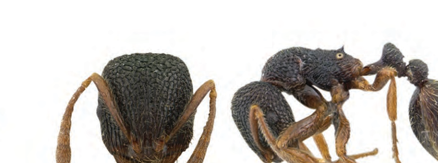
Rogeria stigmatica (Emery, 1897)