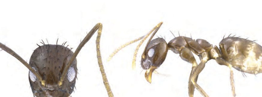
Nylanderia vaga (Forel, 1901)