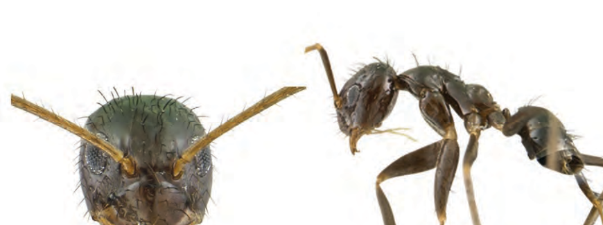
Nylanderia sp. NYLA3