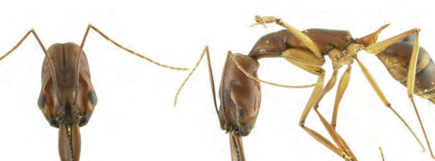
Odontomachus papuanus Emery, 1887