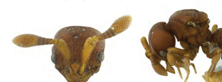
Discothyrea sp.2 MAD